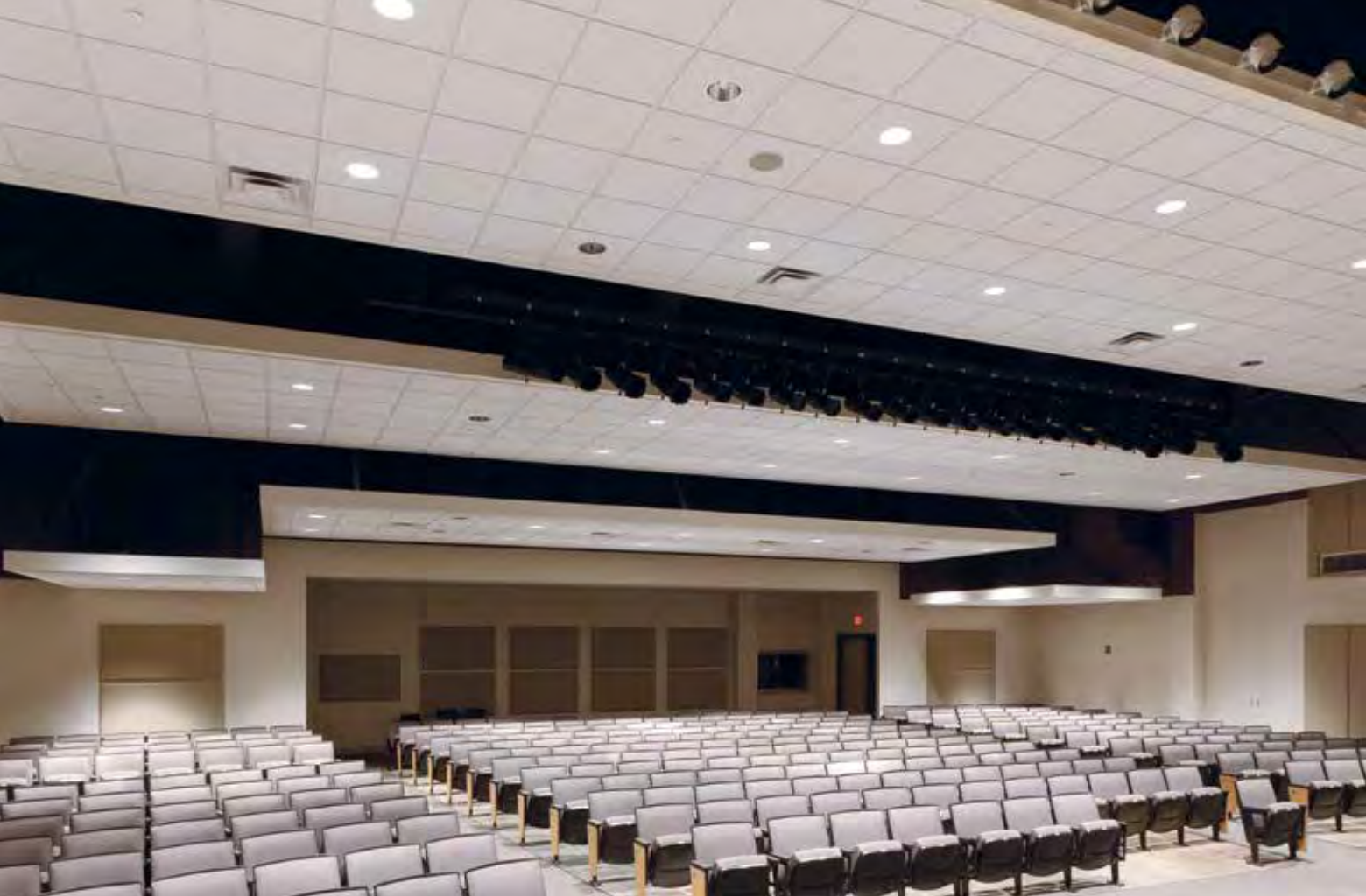
Fine Fissured Reveal (White) (HHF-157)