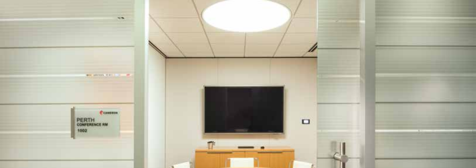
Symphony® m Narrow Reveal (1222BF)